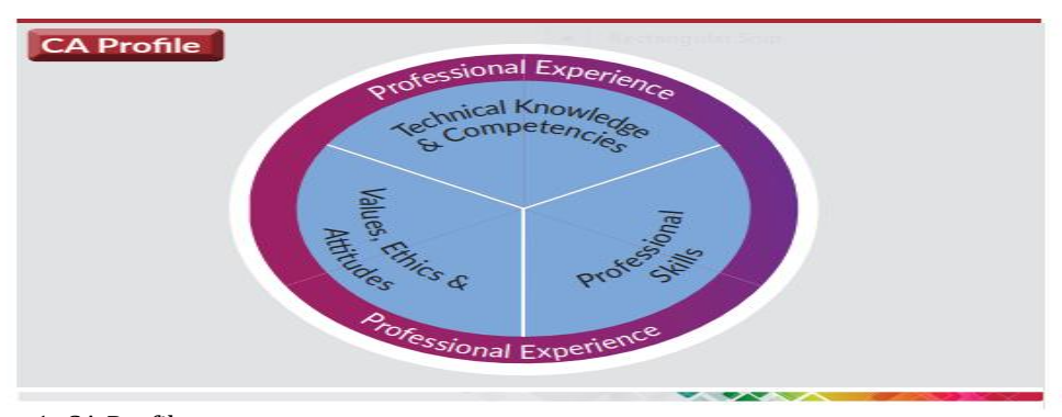
Figure 1: CA Profile

Professional experience provides students an opportunity to experience the attributes of professional skills, values, ethics and attitudes together with technical knowledge and competencies.